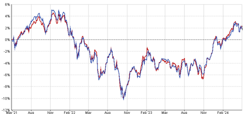
A - IA Mixed Investment 20-60% Shares TR in GB [2.38%] B - VT - Discovery Cautious C Acc GBP in GB [2.17%]

30/04/2021 - 30/04/2024 Data from FE fundinfo2024